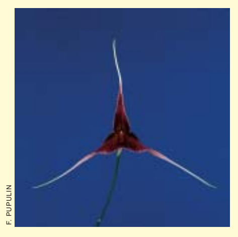
ABOVE A beautiful Dracula discovered by Franco Pupulin on his birthday. He aptly named it inexperata, the "unexpected."

The extensive botanical exploration throughout the country, donations and interchange of plants with other botanical institutions, have built up the living collection of LBG. This living collection includes no less than 10,000 orchid plants, each identified with a label showing the scientific name, the number and name of the collector and a reference number. Plants native to Costa Rica make up 80 percent of the total. The other 20 percent is composed of orchids mainly from South and Central America, with some from Africa and Asia. The number of species is around 1,100, representing about seven of every 10 species native to Costa Rica. There are unique specimens growing in this collection like Dracula inexperata, one of the beauties of Costa Rican pleurothallids; the enigmatic Warmingia margaritacea, a rare oncidioid orchid only known from Costa Rica; and Brachionidium haberi, one of the biggest species of the genus with purple flowers, which is difficult to find and